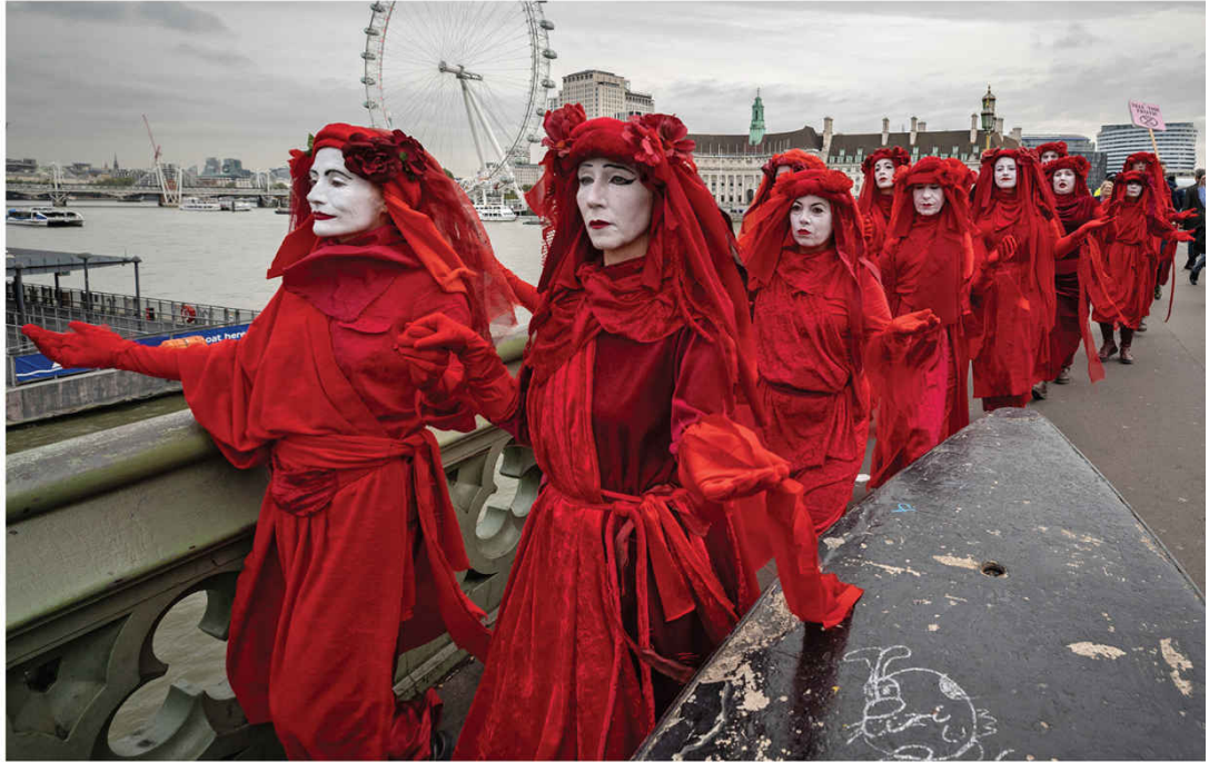
Extinction Rebellion activists, claiming climate change threatened human extinction, halted traffic in London in the spring and fall of 2019.