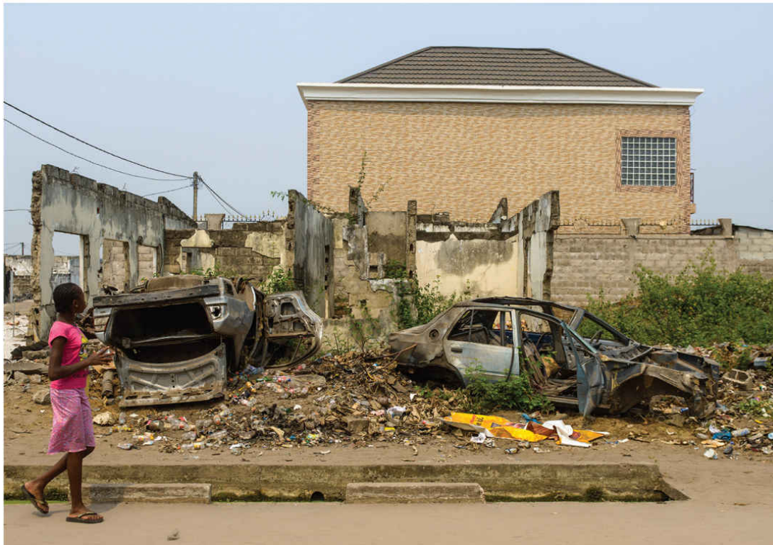
What most determines how much plastic waste goes into the ocean is whether a nation has a waste collection and management system. Developed nations like Japan have such a system, while poor nations like Congo do not.